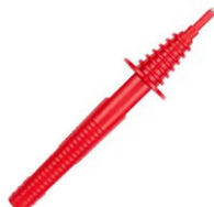
test probe with banana socket; 5 kV; red WASONREOGB2