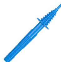
pin probe, blue 1 kV (banana socket) WASONBU0GB1