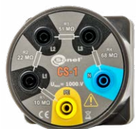
CS-1 cable simulator WAADACS1