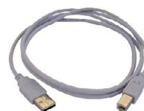
USB cable WAPRZUSB