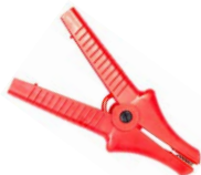
red "crocodile" clip 11 kV 32 A WAKRORE32K09