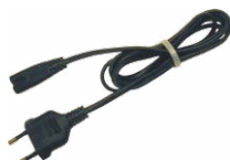
230 V power cord (IEC C7 plug) WAPRZLAD230