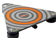
PRS-1 resistance test probe WASONPRS1