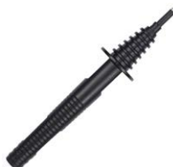
test probe with banana socket; 5 kV; black WASONBLOGB2