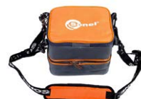
M-8 carrying case WAFUTM8