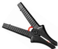
black "crocodile" clip 11 kV 32 A WAKROBL32K09